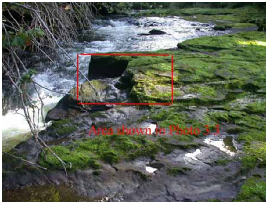
Photo 3.2. Closer location shot of Site 3 from downstream looking N.