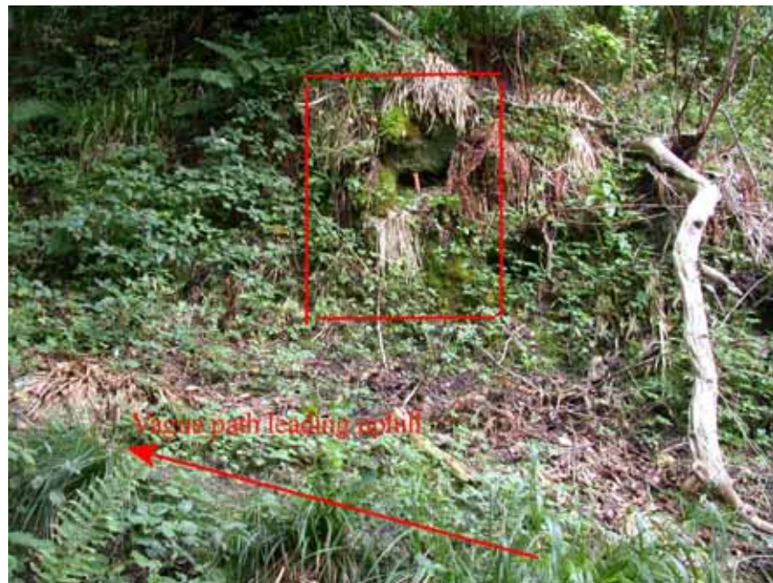
Photo 1.1. Location of stands of Anomodon viticulosus , Eurhynchium crassinervium and Seligeria donniana on Site 1.

Location: A path leads N from the bridge over the Melgam Water along a ledge between the river and crags. As the crags ease back the path divides with one path angling down towards the river and the other heading diagonally upwards across the slope. The site is on broken sandstone crags just above the upper path.