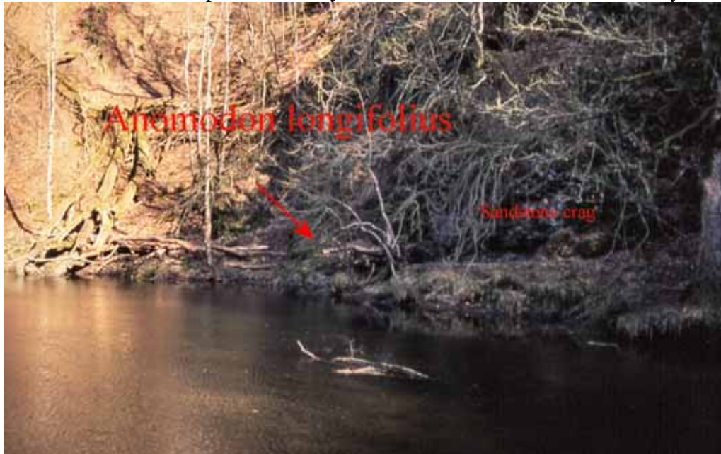
Photo 2.1. The location where Anomodon longifolius was seen in 1996.

Location: The River Isla emerges from a very narrow section into a large pool on a right-angled bend from E to S. On the true left bank of the pool there is a line of crags running S-N which runs into the pool at a rocky rib. The stand occurred on the rocky rib.