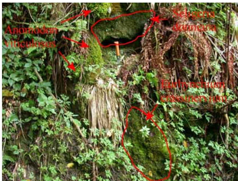
Photo 1.2. Detail of stands of Anomodon viticulosus , Eurhynchium crassinervium and Seligeria donniana on Site 1. Seligeria donniana is too small to be visible but occurs in tiny patches in the area indicated.