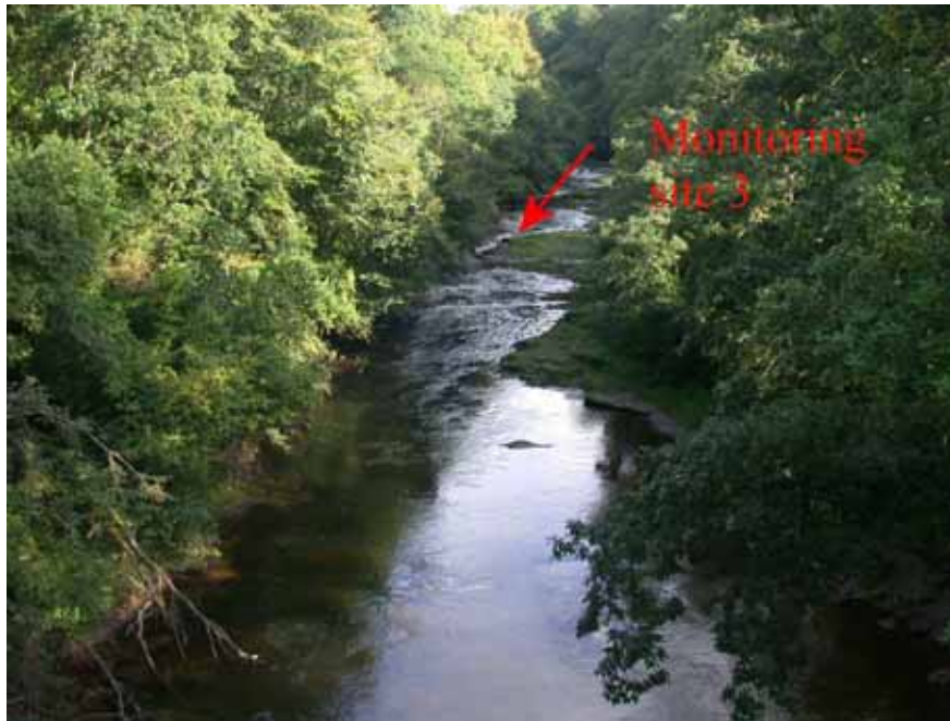
Photo 3.1. Location of monitoring site 3 from the road bridge looking N.

Location: From the road bridge at the S end of the site the sandstone terraces at the side of the river are obvious looking upstream. Access is easy on the R side of the bridge; the site is at the first really narrow section (see photo 3.1)