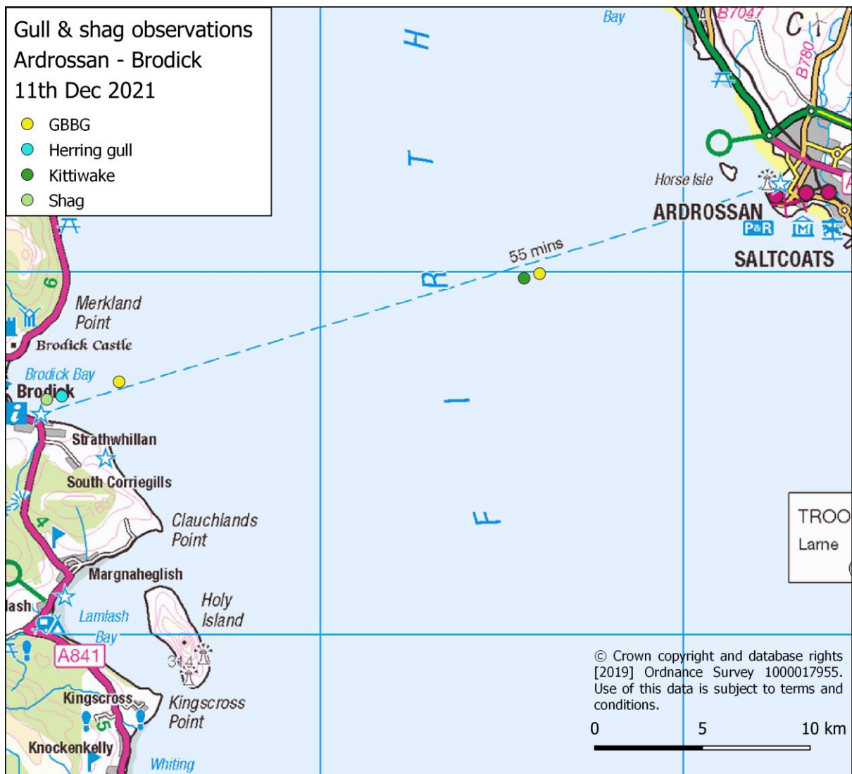
Fig 2. Gull & shag observations recorded during the Ardrrossan to Brodick survey, 11 th December 2021