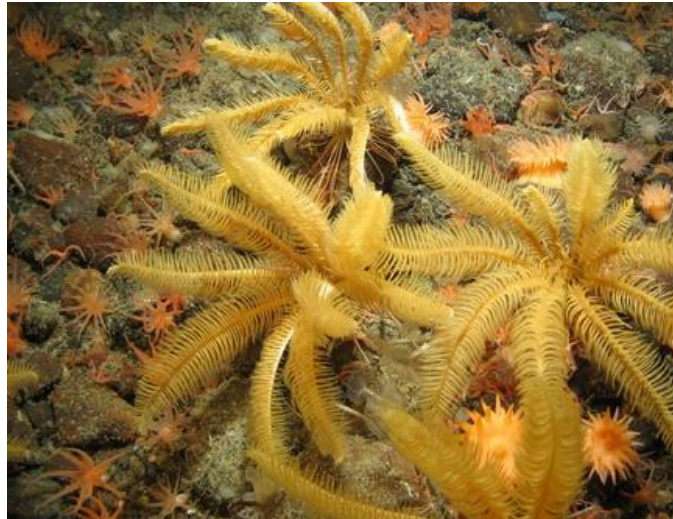
Figure 2. Example of Annex I 'Reef' habitat within the Wyville Thomson Ridge SAC. Boulders covered with yellow feather stars, brittle stars and anemones recorded on Wyville Thomson Ridge.