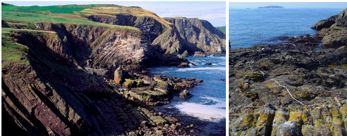
Image credit: (Left to right) Berwickshire and Northumberland Coast SAC ©Laurie Campbell/SNH; Insh Island, Firth of Lorn © Matt Dalkin/ SNH.

Ecosystem description: Rocky shorelines occur in the intertidal zone, the area of the shore between high and low tides and the splash zone. The upper limit is marked by the top of the lichen zone and the lower limit by the top of the laminarian kelp zone.