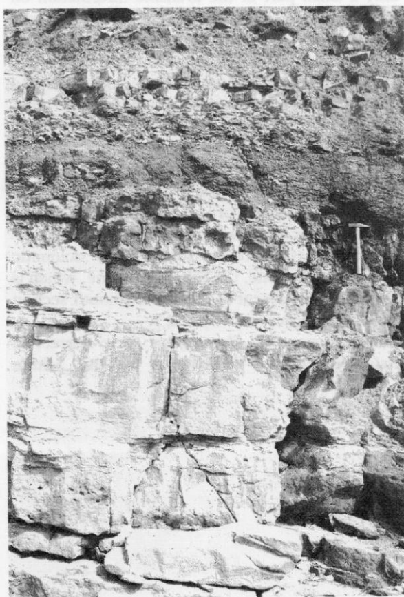
Figure 2.3 Higher beds of the Permian sequence in Barrowmouth Bay, a few metres southwest of the view in Figure 2.2. The line of small cavities in dolomite near the base of this photograph is also visible near the top of the section in Figure 2.2. Most or all of the beds here form part of the Saltom Dolomite, but it is possible that bed 6 may be part or all of the Fleswick Dolomite. Hammer: 0.33 m.

mudstone and siltstone of the St Bees Shales (?60 m) which overlie the St Bees Evaporites (c. 20 m) of which the Saltom Dolomite is here the basal unit. A 7.6 m gypsum/anhydrite noted low in the sequence by Binney (1855) was formerly worked in galleries up to 9 m high at the nearby Barrowmouth Alabaster Mine which closed in 1908 when the workings encountered an unprofitably high proportion of anhydrite; Binney's view on the low position of the gypsum/anhydrite bed was disputed by B. Smith (in Eastwood et al. , 1931) who suggested that it was separated from the limestone by 'a considerable thickness of shale'. It is likely to be either the Sandwith Anhydrite of Arthurton and Hemingway (1972) or a combination of the Sandwith Anhydrite and the Fleswick Anhydrite.