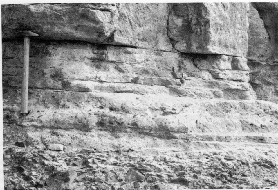
Figure 2.2 Lower beds of the Permian sequence at the south-west end of the Barrowmouth Beach (Saltom Bay) section, showing Saltom Dolomite resting on the slightly uneven surface of the Brockram or Basal Breccia. Hammer: 0.33 m.

mudstone and siltstone of the St Bees Shales (?60 m) which overlie the St Bees Evaporites (c. 20 m) of which the Saltom Dolomite is here the basal unit. A 7.6 m gypsum/anhydrite noted low in the sequence by Binney (1855) was formerly worked in galleries up to 9 m high at the nearby Barrowmouth Alabaster Mine which closed in 1908 when the workings encountered an unprofitably high proportion of anhydrite; Binney's view on the low position of the gypsum/anhydrite bed was disputed by B. Smith (in Eastwood et al. , 1931) who suggested that it was separated from the limestone by 'a considerable thickness of shale'. It is likely to be either the Sandwith Anhydrite of Arthurton and Hemingway (1972) or a combination of the Sandwith Anhydrite and the Fleswick Anhydrite.