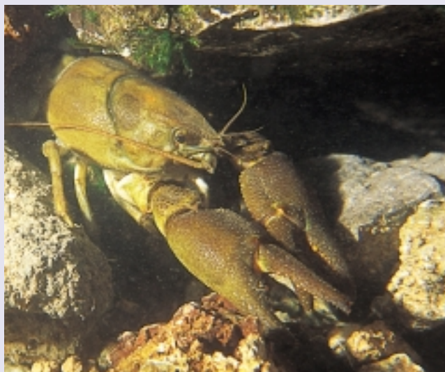
Native white clawed crayfish are severely threatened by competition from the introduced American signal crayfish.