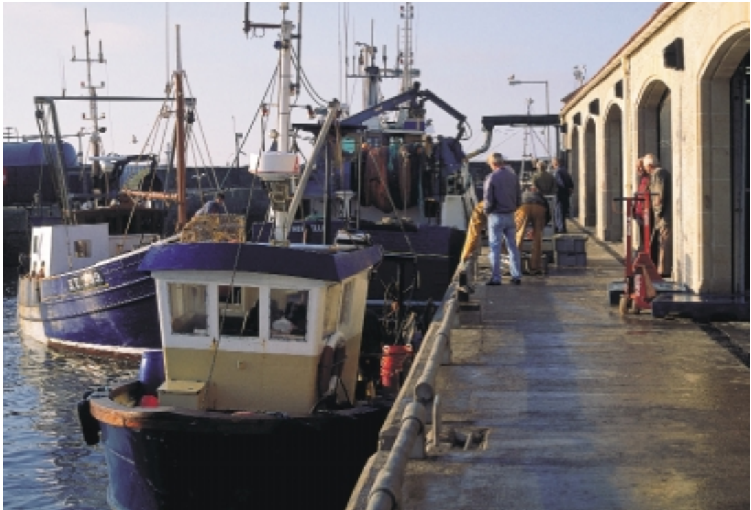
The sustainable harvesting of marine species presents a major challenge.