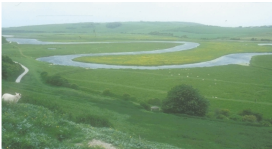
Flood plains provide natural defences. Development planning for such areas should sustain their natural processes.

which society can and should work in harmony with nature. It stressed that consideration of the implications for biodiversity should be integrated into all sectors of economic and social activity, as an important component of sustainable development and as a principal measure of its success.