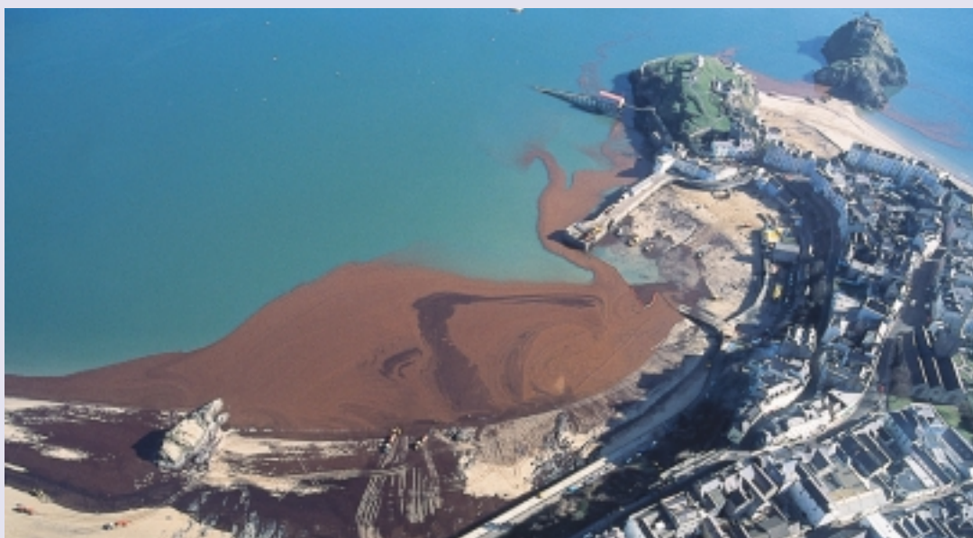
Sea Empress Oil spills Tenby Harbour.