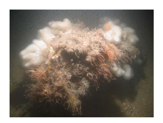
8<sup>th</sup> May 2012 v1.0