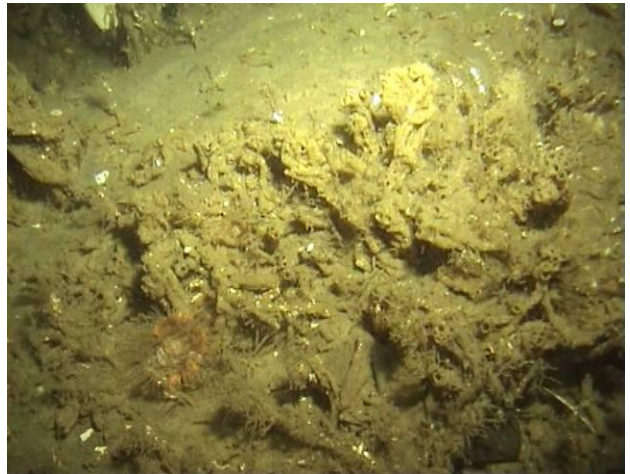
Plate 2: Fine sand and Sabellaria spinulosa crust