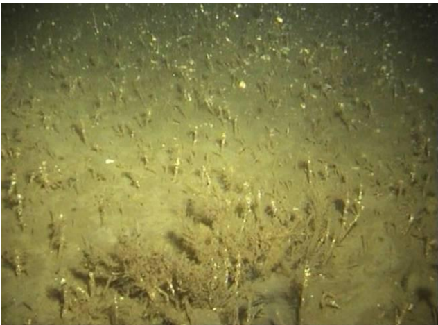
Plate 3: Fine sand colonised by sand mason Lanice conchilega