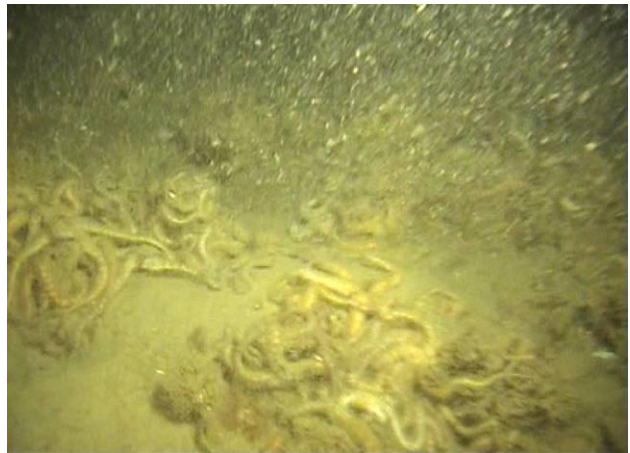
Plate 4: Medium sand with shell and silt; with brittlestars Ophiothrix fragilis