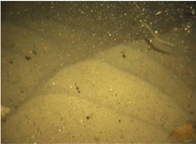
Plate 1: Medium rippled sand with sand eels Ammodytes sp